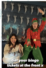
Get your bingo tickets at the front x