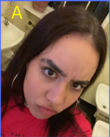
'sexiest snow member' -said too many times to pinpoint