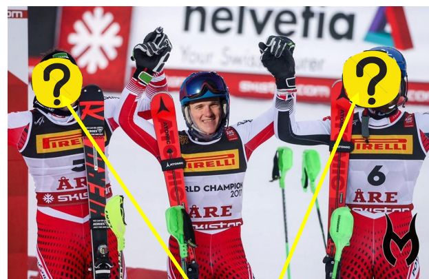
This could be you

I study law. (I live for paperwork/ will make sure tour contract is upheld)