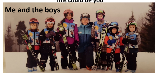
Me and the boys