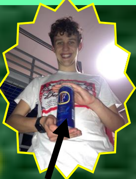
Fig 1. Fosters holding Fosters with evil grin

Circling is a key part of any warwick sport society and warwick snow is renowned for its well loose circles (just like my anal sphincters???) As SOCIAL SECCC I promise to run the most HEINOUS circles you have ever witnessed (don't even think about claiming) and will ensure that wazza snow's reputation is upheld as "No.1 Social Society" (sports society my ass).