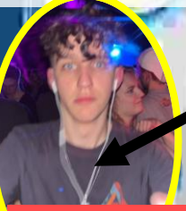
Fig 3. Me thoroughly enjoying myself at POP!

I pride myself as an approachable person (that is when im not naked) and as social sec I will ensure that all new members feel welcome at warwick snow and encourage them to come to as many socials as humanly possible!!